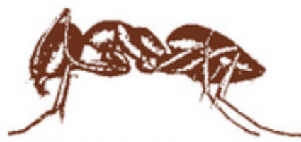
ODOROUS HOUSE ANTS